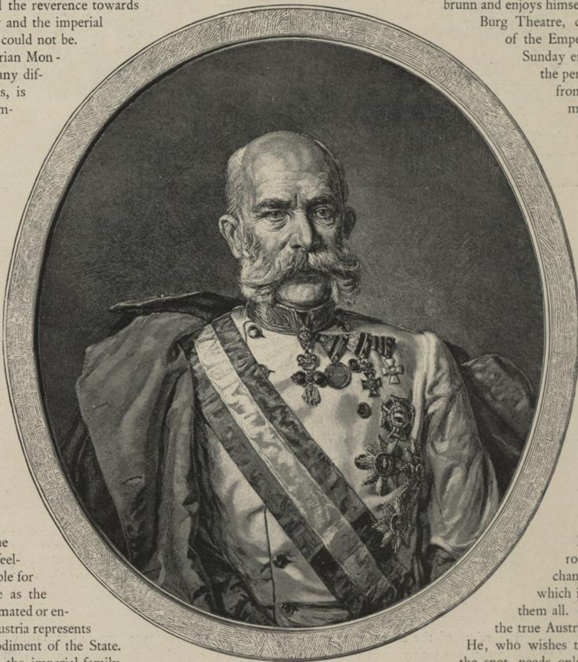
THE EMPEROR FRANCIS JOSEPH.*)

will then soon learn that the honest fellow has shared with his Emperor, during the past fifty years of his reign every joy and every grief that has