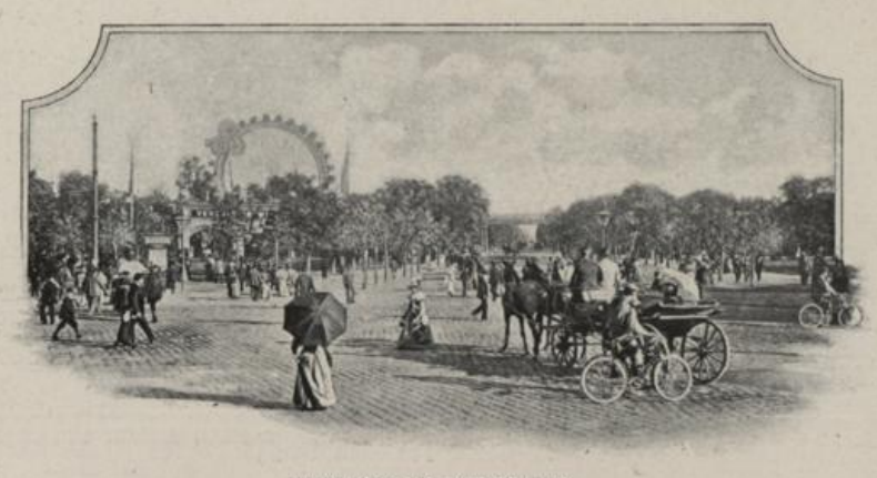
ENTRANCE TO THE PRATER

Nevertheless, we notice already now, how great a benefit is derived from the two existing lines of the City Railway. They run nearly parallel to each other; the one encircles the former suburbs, the other passes through the outlying districts from the Upper Danube towards the River Wien. These two lines very soon after their inauguration enjoyed