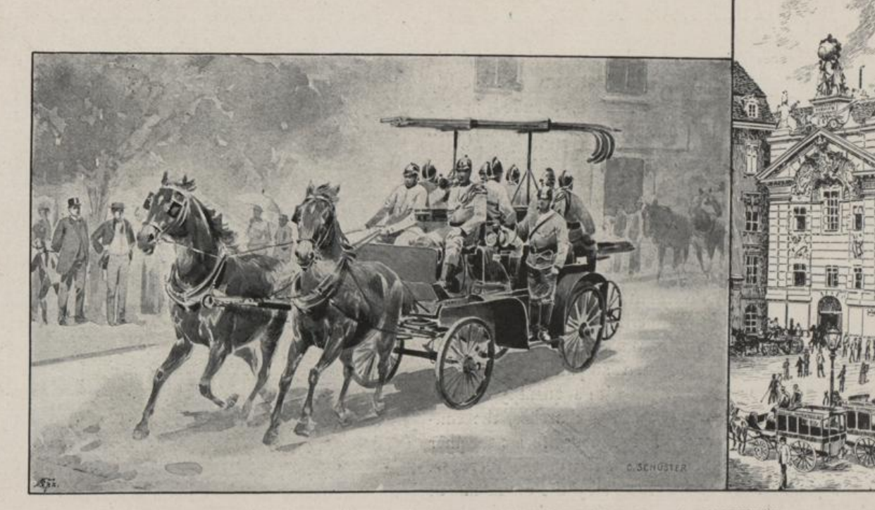
FIREBRIGADE AND OLD ARMORY (NOW CENTRAL FIRE STATION). Drawn by C. SCHUSTER.

take his morning walk outside the walls of the city amidst vineyards, gardens and shrubberies. But the wicked new era has procured instead new and rapid means of communication in great number, so that one can reach to day in a few hours spots that formerly by their distance were unattainable. It is in fact to day easier than ever to enjoy the wealth of scenery of the Vienna landscape, which is made so incomparably beautiful by the combination of five great elements, the mighty Danube, the plain of the river March, forests, chains of mountains, and last but not least the city itself. One point especially, affords opportunity to overlook these mighty five at