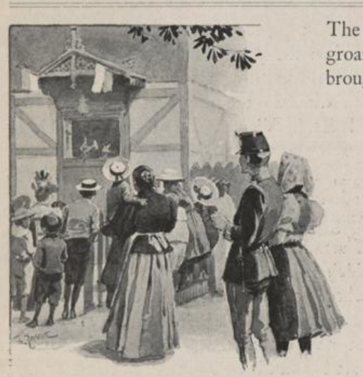
PUNCH AND JUDY SHOW IN THE PRATER.

a communication between the waggons, so that one can pass through all of them, looking for a place to find. The cars divided into sections would not do for the Vienna population, who are too undecided and "gemütlich" to make