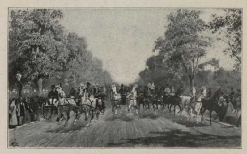
A DRIVE THROUGH THE PRATER. After a Water colour by GOTTFR. WILDA.

the patronage of the public. True they were opened in the beginning of the lovely summer season and part of their traffic may be due to the desire of getting quickly into the country, but great frequency exists also between the different districts. On sundays the rush has sometimes been