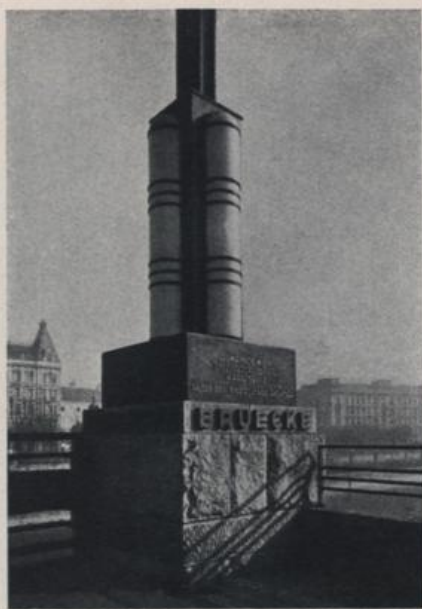
AUGARTENBRÜCKE, WIEN 1929—1931