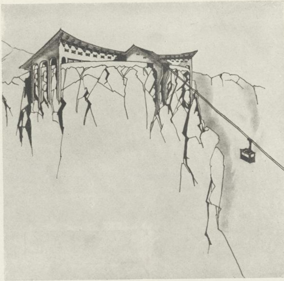
BERGSTATION AM KARLEISFELD DER GEPLANTEN DACHSTEINSEILBAHN (1929)