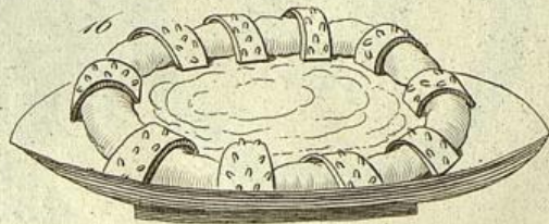
Gehäcke von Fusanen