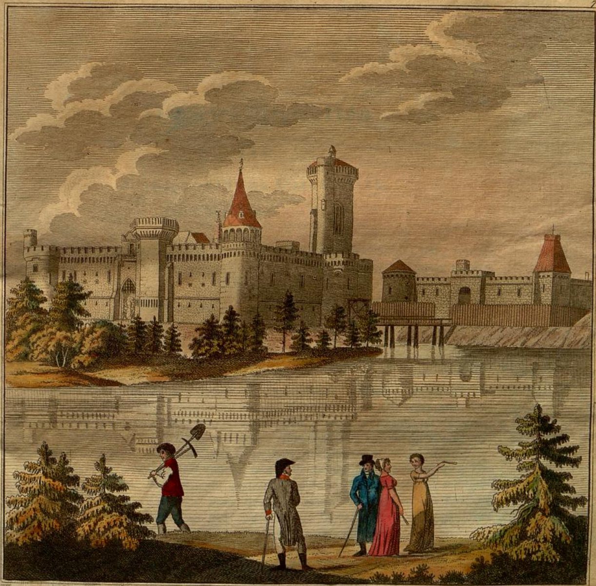
VI Das Pitterschloss zu Laxenburg.